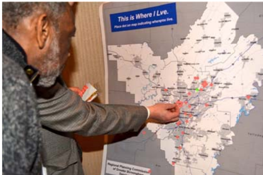
Attendees identify where they live in the region