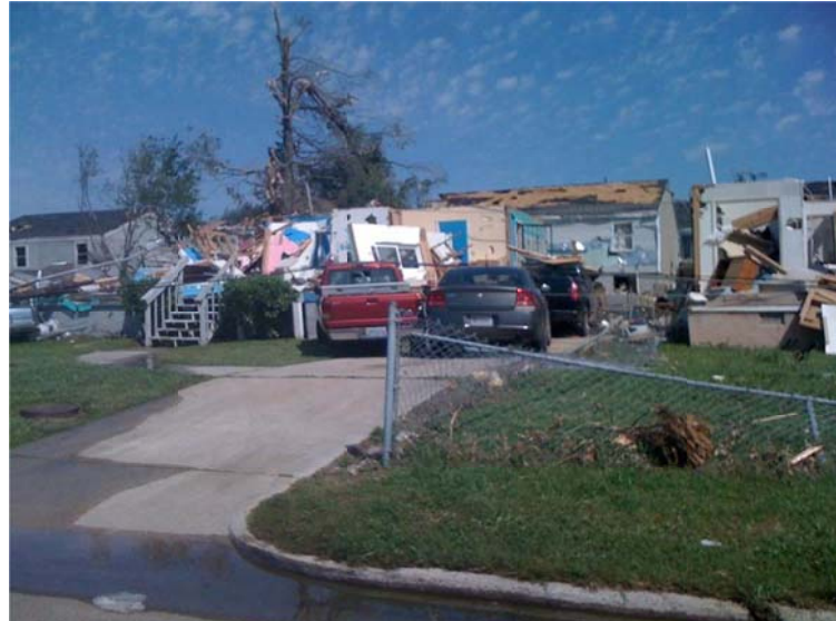
Destruction in Pleasant Grove

The April 27 tornadoes left many homes and businesses destroyed in the RPCGB's six county region. The Commission is actively assisting in the rebuilding efforts in several different areas and has created a section on the RPCGB website dedicated to regional recovery.